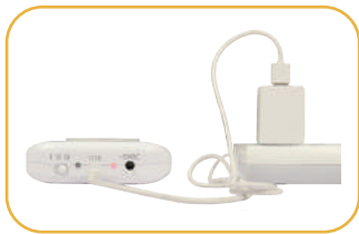
USB Power Source (5v Phone Charger)

You can choose the power option which best suits your needs.